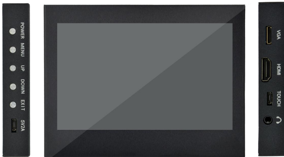
DEBIX TD050H-C (with Al alloy enclosure)